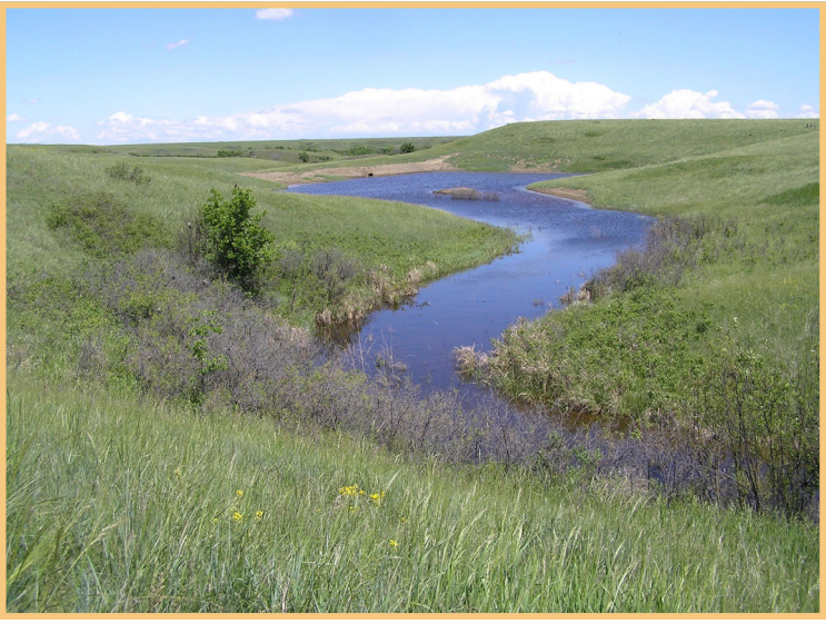
Forestry and Rangeland Water Quality Projects